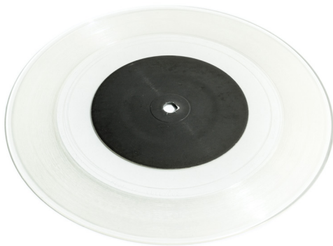
Clear AuroraTec rigid PVC offers the ability to create a transparent, see-through product.